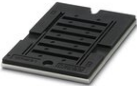
The figure shows version

Magazine, for the THERMOMARK PRIME and the THERMOMARK CARD, for accommodating UCT-TM..., UCT1(U)-TM..., UCT5-TM..., UCT-EM (5x10), UCT-EM (6x10)